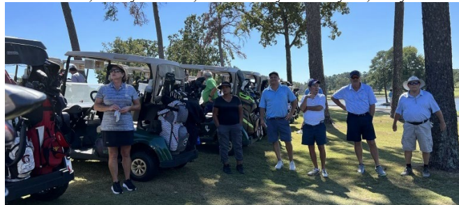
Golfers ready to tee off