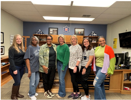
Troop E - January 28th