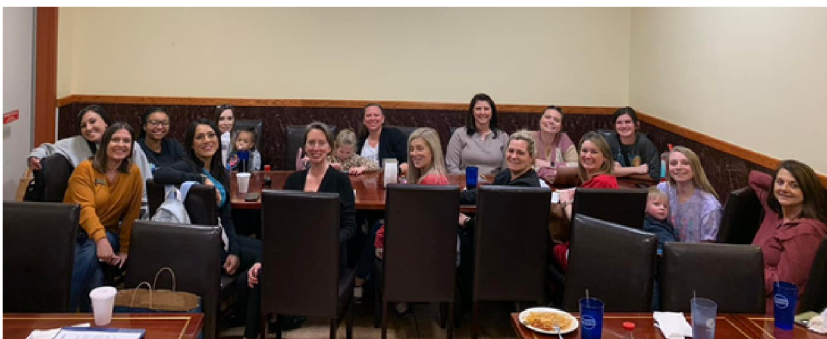
Troop K - February 13th