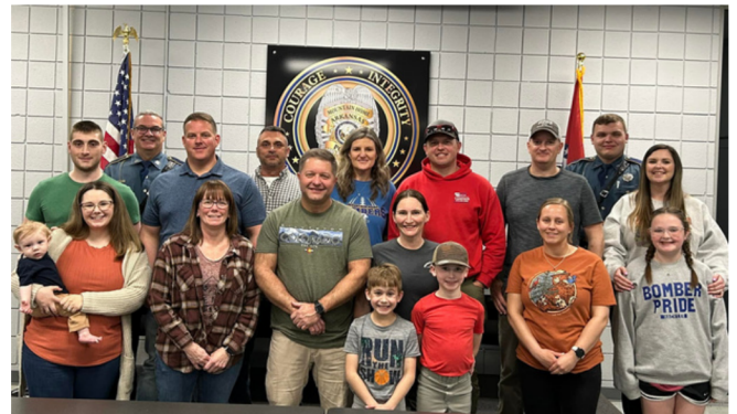
Troop I - February 26th