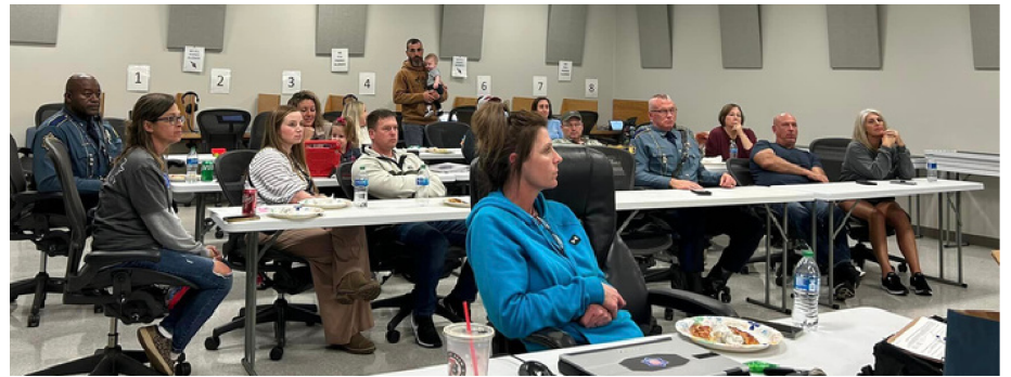
Troop J - February 8th