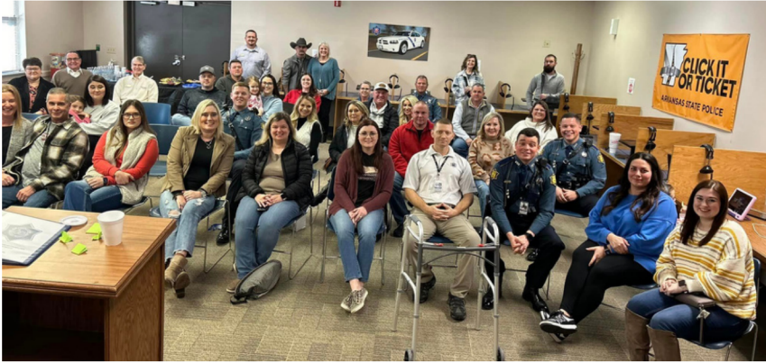
Troop C - February 18th