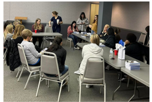
Troop A - February 12th