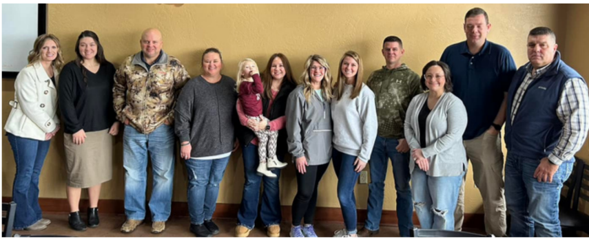
Troop B - February 11th