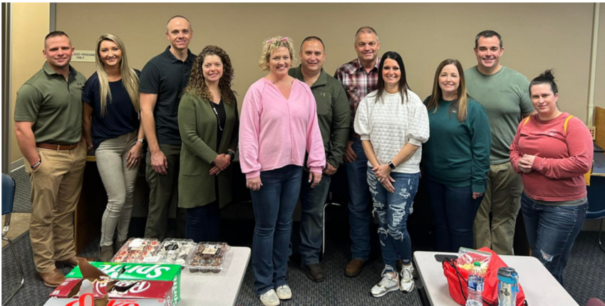
Troop H - February 22nd