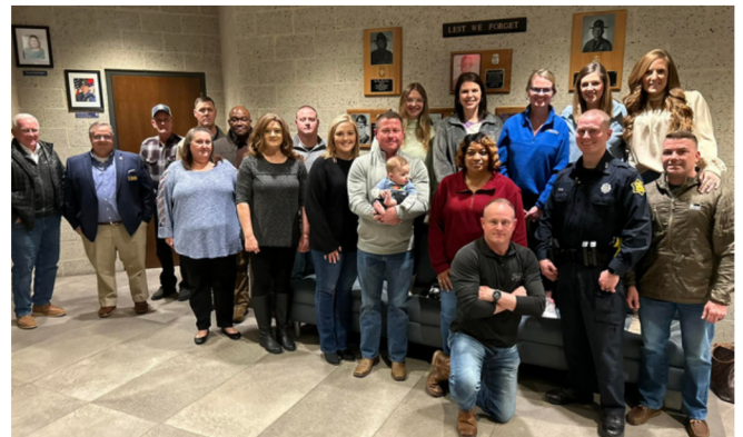
Troop D - February 28th