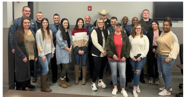
Troop F - February 17th