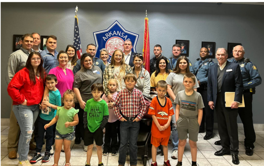
Troop G - February 27th