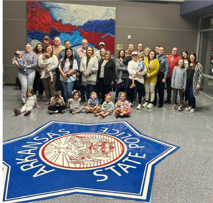
Troop L - February 21st