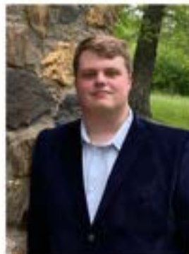
Whitten Overton National Park Community College