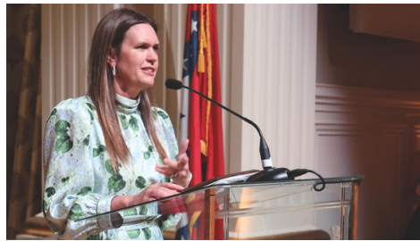
Governor Sarah Huckabee Sanders Ermon Cox Award