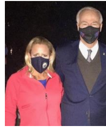
Attorney General Leslie Rutledge and Governor Asa Hutchinson